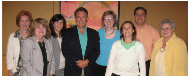
Members of the ITCA Board participating in the Summer Board retreat.